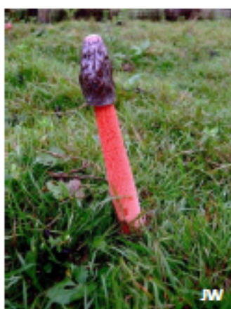
Devils Stinkhorn fungi ( Phallus rubicundus )